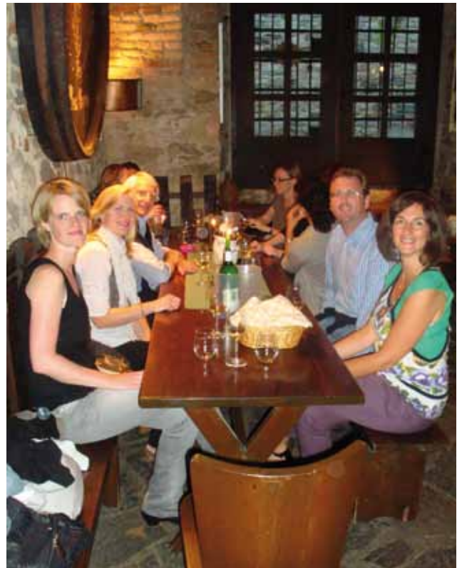
Wine Tasting in Dürnstein